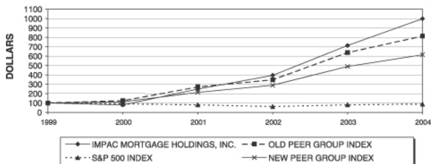
COMPARE 5-YEAR CUMULATIVE TOTAL RETURN AMONG IMPAC MORTGAGE HOLDINGS, INC., S&P 500 INDEX AND PEER GROUP INDEX

ASSUMES $100 INVESTED ON JAN. 1, 2000 ASSUMES DIVIDEND REINVESTED FISCAL YEAR ENDING DEC. 31, 2004